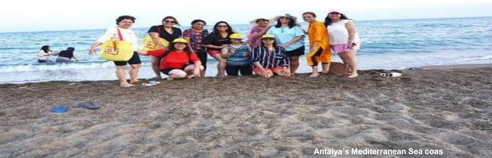
Antalya's Mediterranean Sea coas