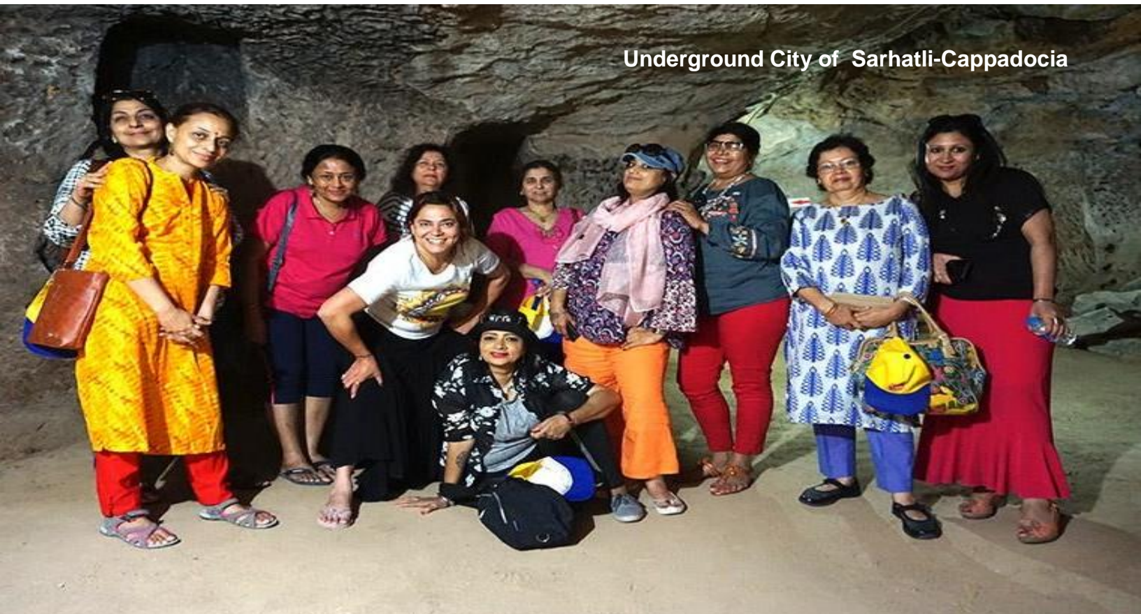
Underground City of Sarhatli-Cappadocia

From India we board our flight & reach at Istanbul. After finishing our immigration formalities we get transferred to domestic airport to board our flight to Cappadocia. Your lunch will be provided in form of hot patties/sandwich along with various choice of beverages during your Cappadocia flights. We arrive at Cappadocia airport & from here we will directly visit underground city of Ozkonak . Afterwards check into your hotels & relax to conserve your energy for the next day. Dinner at your Hotel. Have a comfortable sleep & dream for next day full of exciting activities.